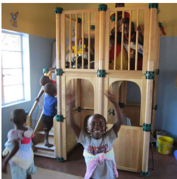
This climbing tower was donated by a Doncaster play centre and sent to the ECD earlier this year