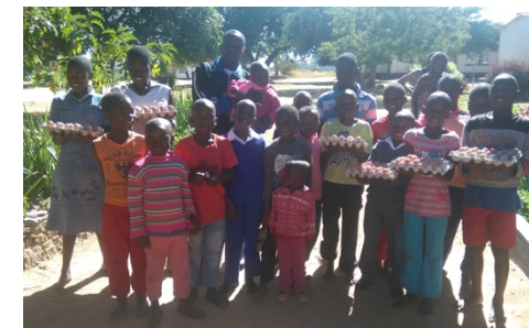
The first 203 eggs from the laying hens went straight to the children

Here are the children in their new winter uniform - thanks to the May remittance which got here just in time to purchase them. See the wonderful work that all the Friends are contributing to. Your support greatly enhances the lives of the children. It was not too cold on this day so they are not wearing jerseys. In July MRCH is like a farming community. It certainly provides a varied nutritious diet for the children and we are able to sell the excess.