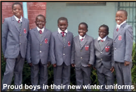
Proud boys in their new winter uniforms

Under the church's vision for 2022, our mission is to transform the lives of orphans and vulnerable children in Zimbabwe through biblical teaching, nurturing and training, helping them to become adaptive and responsible citizens able to make a positive contribution to society.