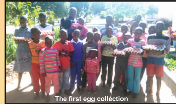
The first egg collection

Although residential care is the only option for some children, the organisation prefers to help deprived children in their own social setting, which is better for the child and means that scarce funds go further. As well as running the home, the organisation helps around 1,000 children in the community.