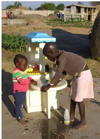
Imaginative play, preparing 'lunch'