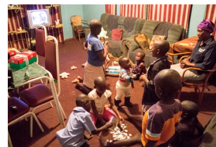
A family playing together at home