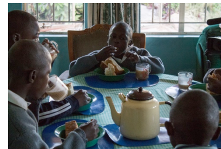
A substantial breakfast before school

Copies of the DVD are available from our secretary; in the autumn the photos will be available to download from our website.