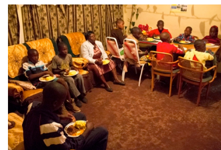
At home with tea and television