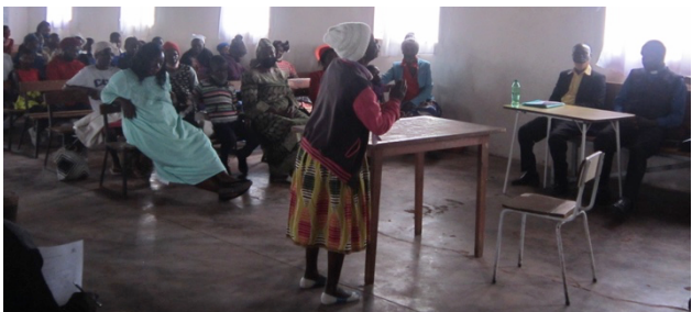
Local families gather in the local church waiting for the distribution to begin.