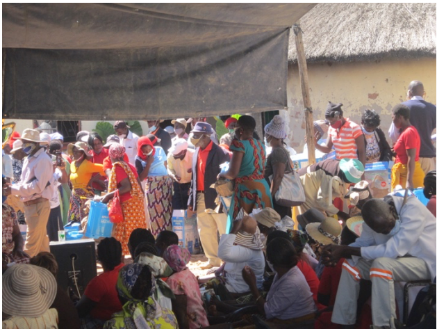
The Outreach Centres receive donations of food and clothing which are distributed amongst the vulnerable families in the local community.