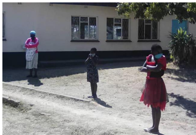
Staff and children wait to be tested

Four out of the 23 children developed mild symptoms and the rest were asymptomatic. Two houses were used as isolation areas with two caregivers who did an excellent job managing the children. We worked as a team with the rest of the staff and at the moment we have no new cases.